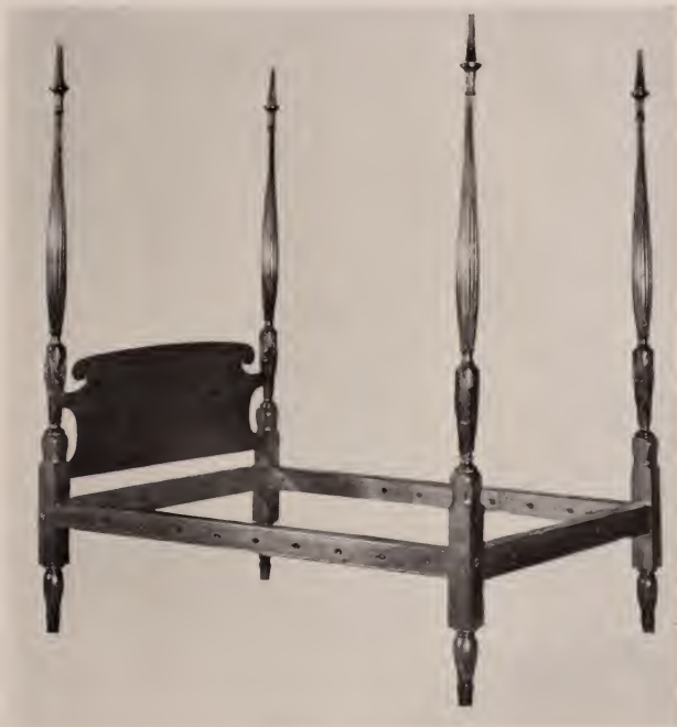
180—RARE HEPPLEWHITE CARVED MAHOGANY FOURPOST BEDSTEAD American, XVIII Century

440.— Slender graceful posts with leaf motived capitals and expanding reeded shafts set upon vase-shaped baluster, enriched with festoons of drapery caught with rosettes and pendent tassels. Supported on square lower shafts with diminishing baluster legs. Small scrolled head-board.